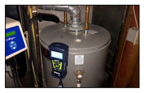
Image 4. Technician measuring undiluted carbon monoxide with a combustion analyzer after performing the steps outlined above.